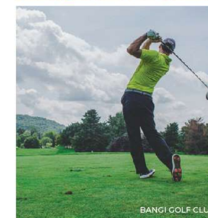
BANGI GOLF CLUB